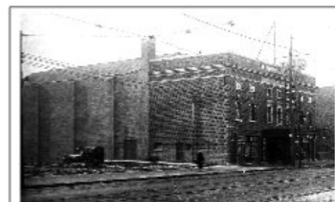
Allen's Danforth, 1919