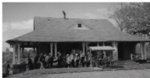
St. Matthew's Lawn Bowling Club

The St. Matthew's Lawn Bowling Club was established on land south of St. Matthew's Anglican Church, 135 First Avenue, following the erection of the Church in 1890. To