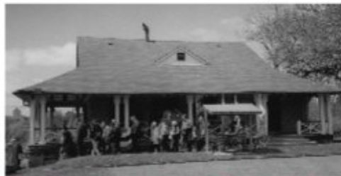
St. Matthew's Lawn Bowling Club

The St. Matthew's Lawn Bowling Club was established on land south of St. Matthew's Anglican Church, 135 First Avenue, following the erection of the Church in 1890. To