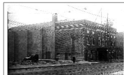
Allen's Danforth, 1919